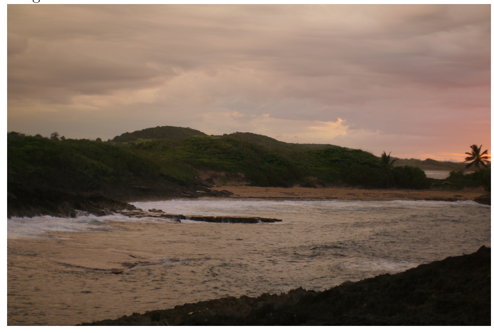
Figure 17: Looking east from beach rock promontory at same location.