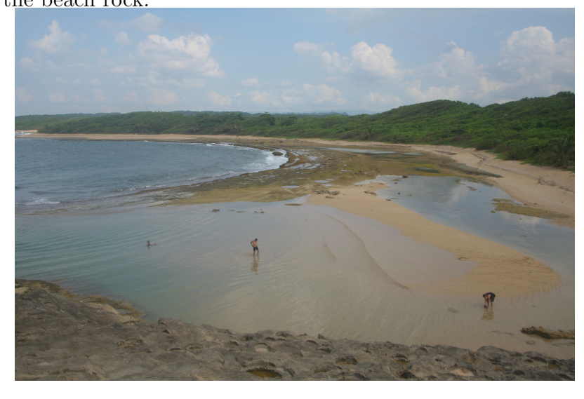
Figure 11: At low tide waves break at the baeach rock but do not go over it.

Figure 10: Photo taken from Tómbolo toward the Southeast. Wave breaking show the location of the the beach rock.