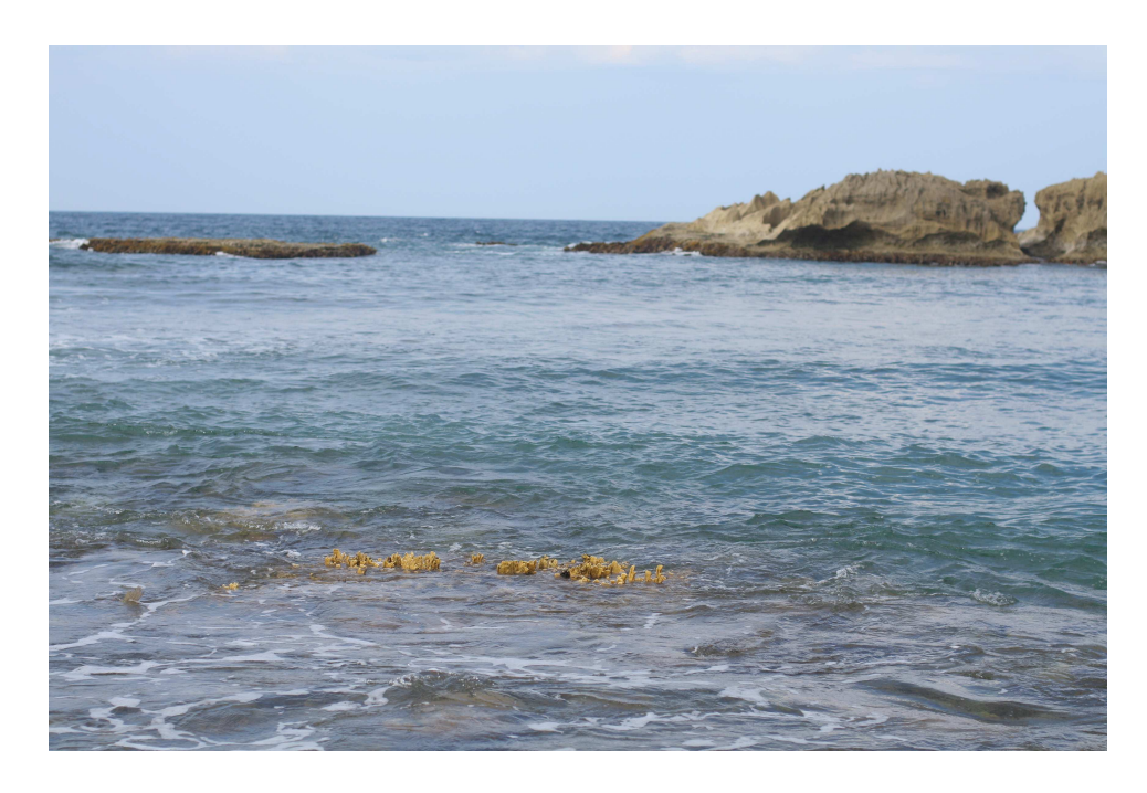
Figure 24: Exposed upper section of Fire coral (Millepora complanata).