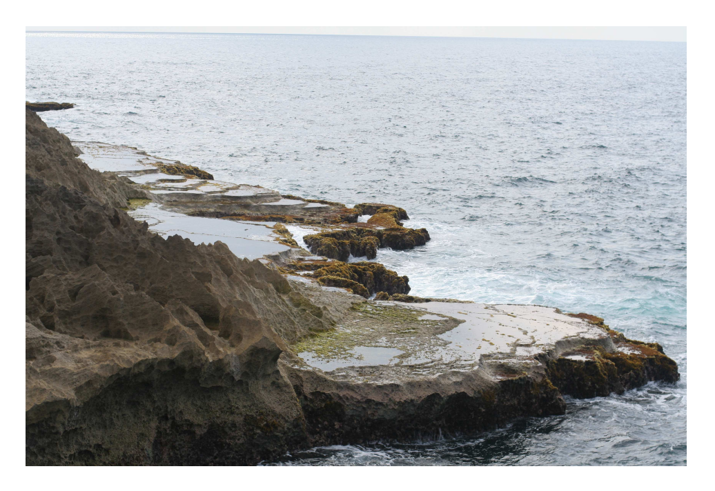
Figure 26: Exposed wave-cut platforms on northern part of beach rock promontory at Punta Manatí.