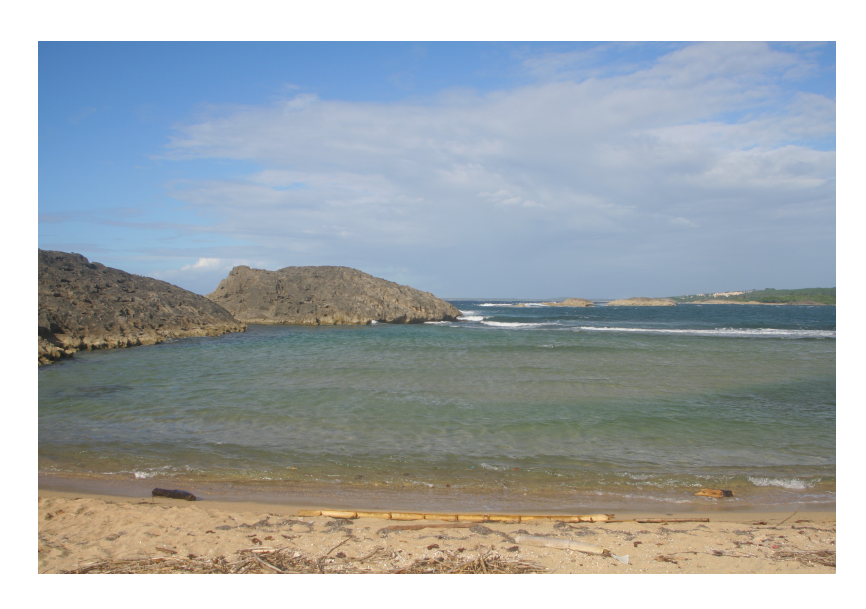
Figure 8: Also looking east from Tómbolo. Continuation to the left from Figures 6 and 7.