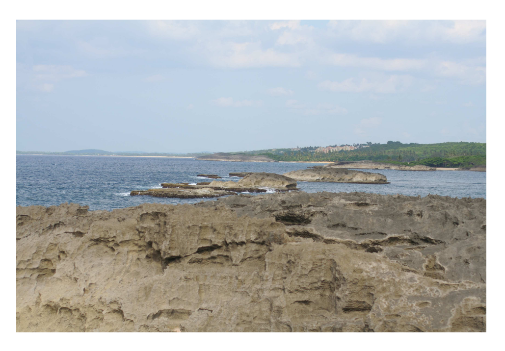
Figure 18: Low tide at Tómbolo looking east at the wave-cut platforms north of the beach rock promontories.