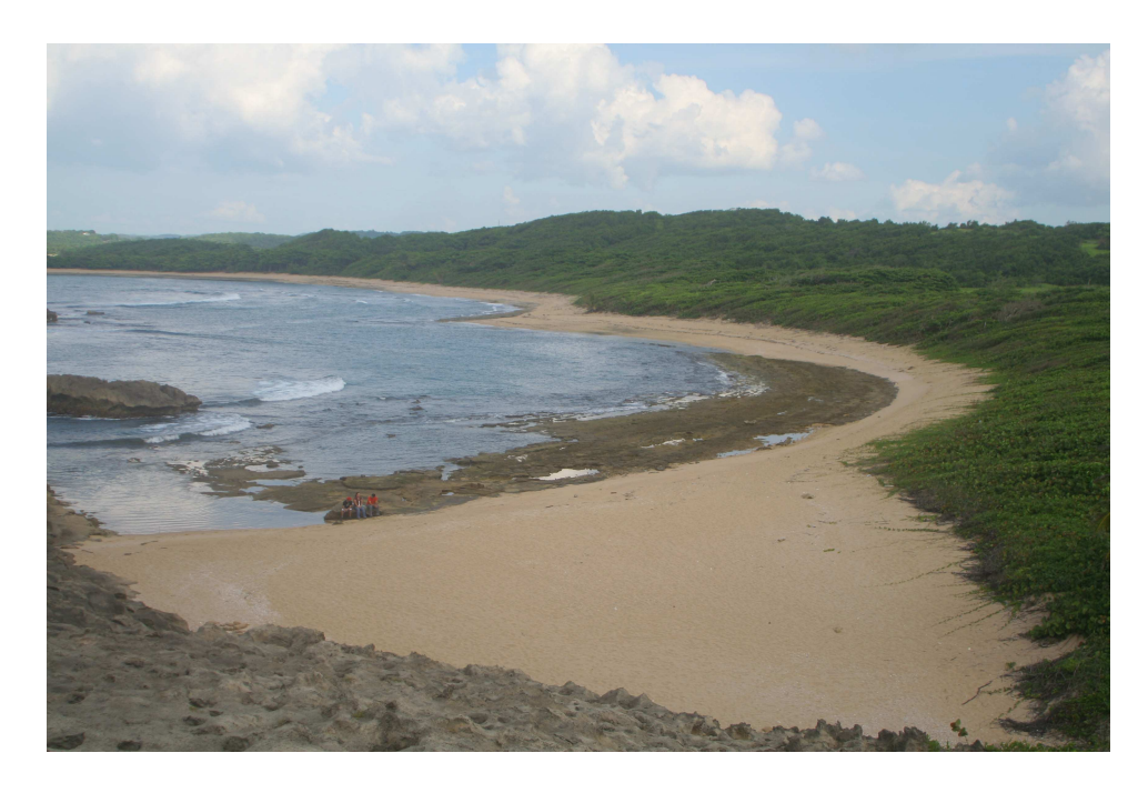
Figure 28: Looking west of Punta Manatí. Beach rock exposed and the location where Figures 21 \underline{\phantom{a}} 24 were taken.