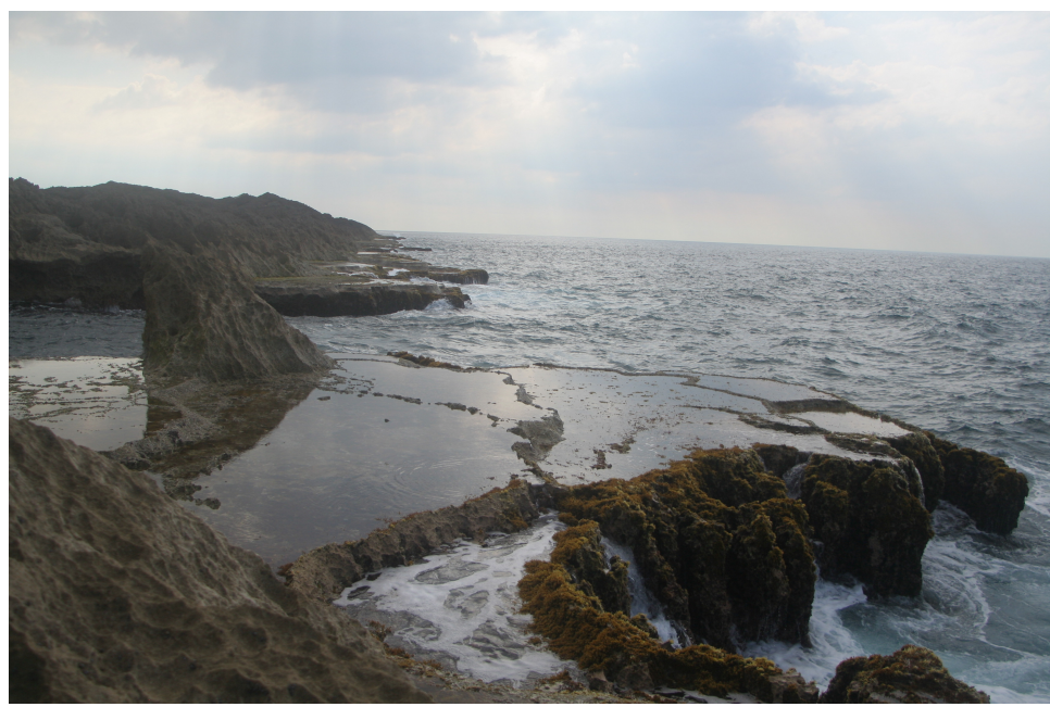
Figure 27: Closer to the wave-cut platform. Notice the change in level where the waves used to break.