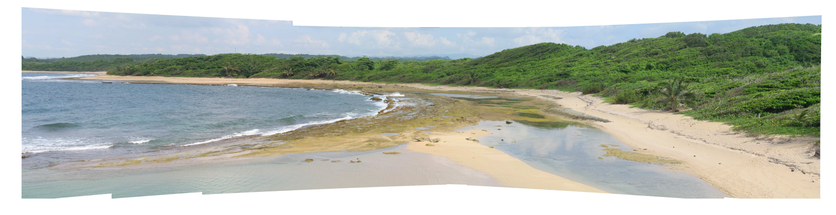
Figure 30: Panoramic photo looking east of Tómbolo at low tide.