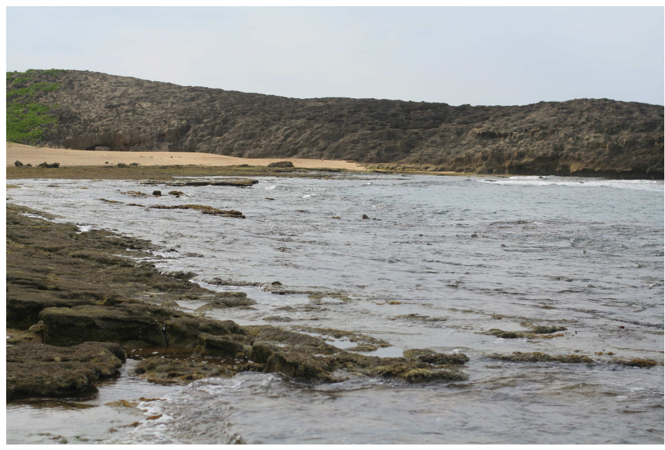
Figure 21: Eastern terminus of Punta Manatí. This zone is where corals and sea fans are partially exposed.