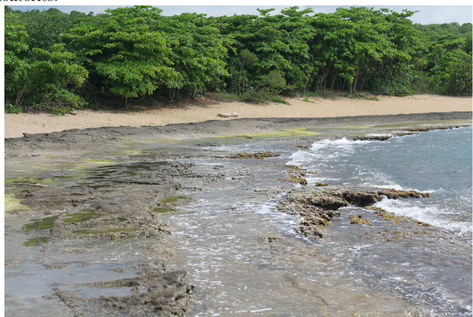
Figure 19: Looking west of Tómbolo at exposed beach rock.