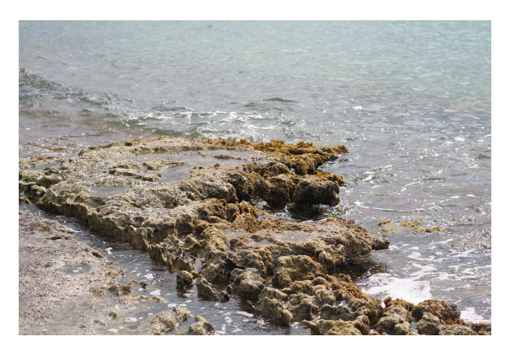
Figure 20: Close-up of the exposed limit of the beach rock. Algae can be seen growing on the rock.