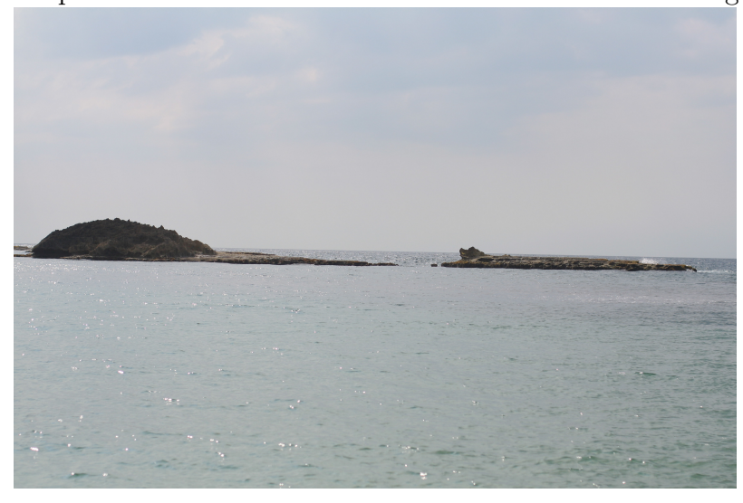
Figure 15: The same platform is completely exposed at low tide.