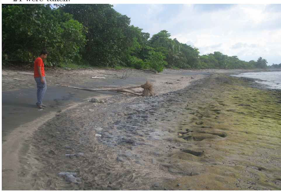
Figure 29: West of Punta Manatí, toward the mouth of Río Grande de Manatí.