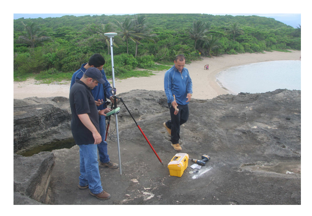
Figure 31: Employees of Vernix Engineering installing and measuring Punta Manatí benchmark.