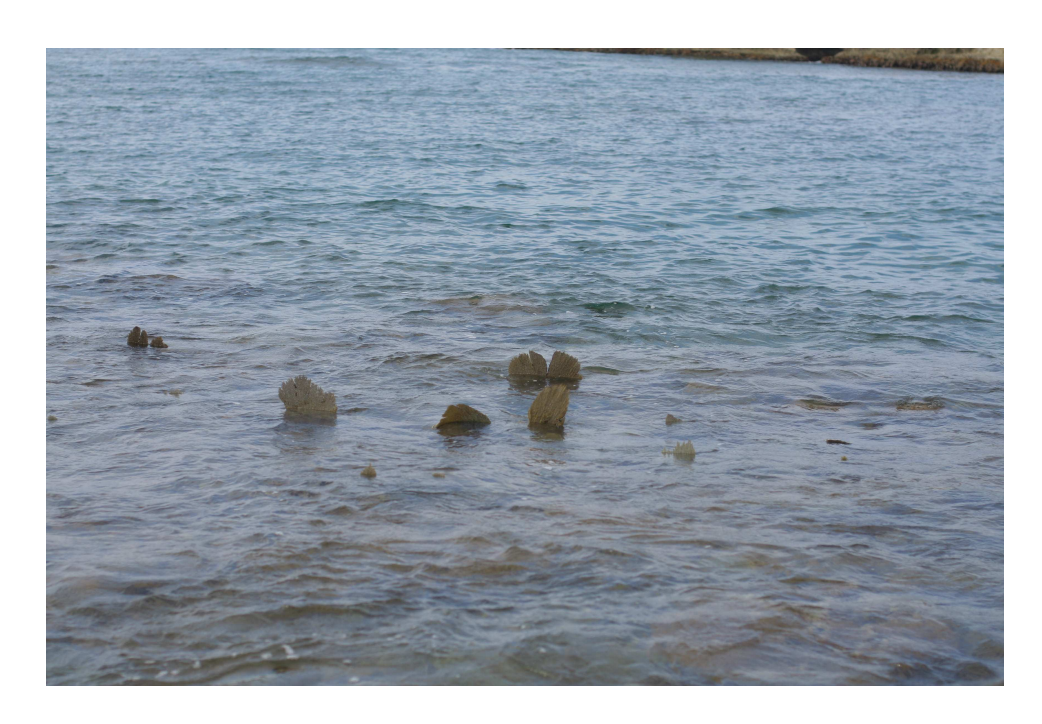
Figure 22: Exposed sea fans.