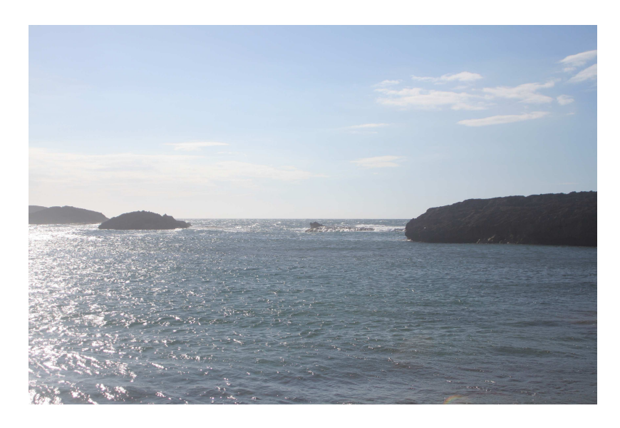
Figure 14: Immediately west of Tómbolo. Notice the partially submerged wave-cut platform at the center of the photo. Western terminus of Tómbolo is seen on the right of the photo.