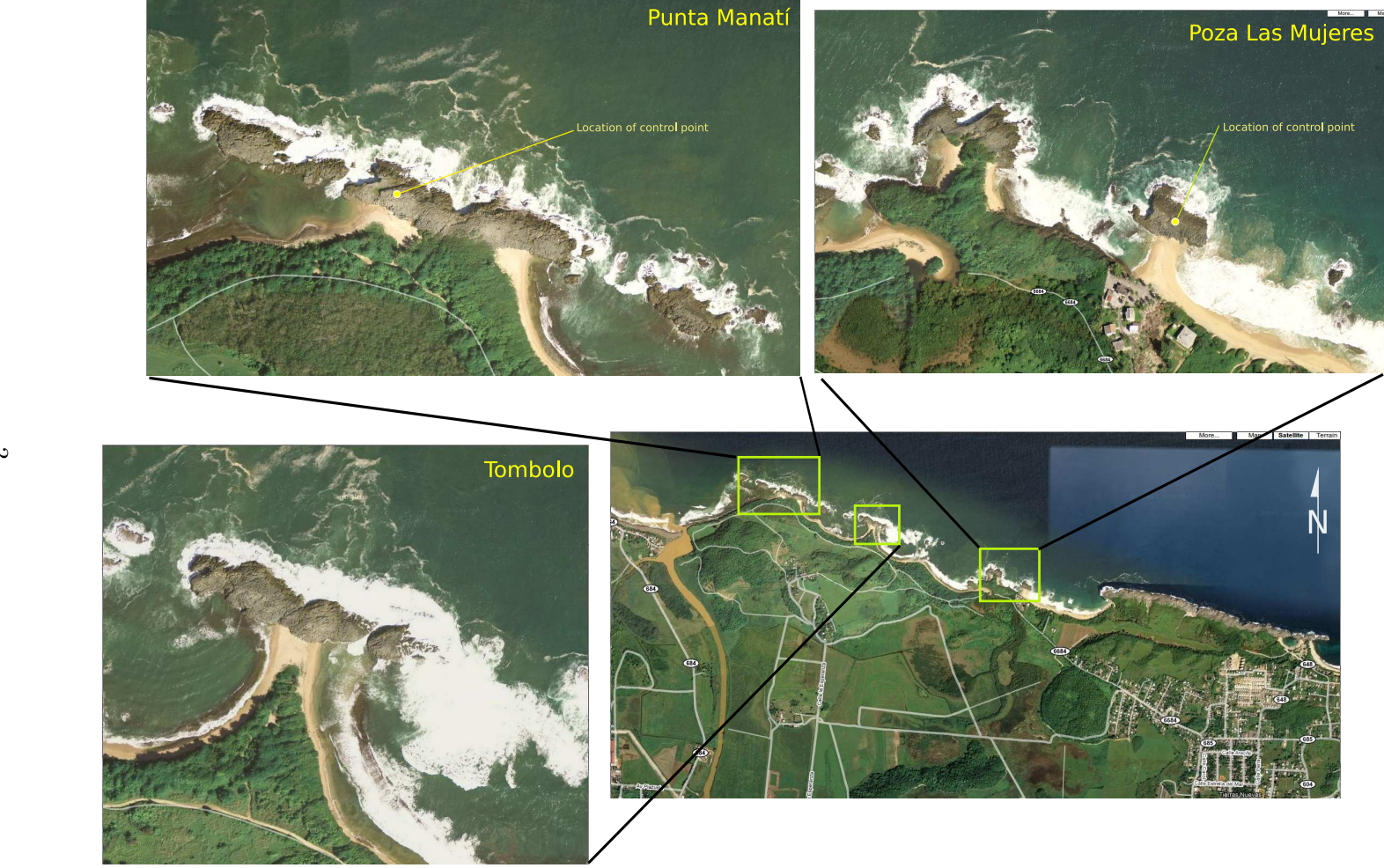
Figure 1: Aerial image of the study area. The two upper figures show the location where the GPS control points were installed; Punta Manatí (left), and Poza Las Mujeres (right). Both locations are accessed through the Hacienda La Esperanza from the Conservation Trust of Puerto Rico.