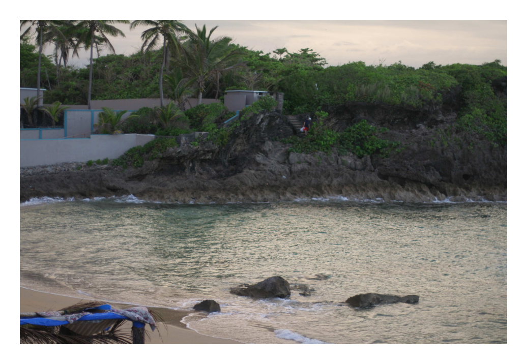
Figure 16: High tide at Poza Las Mujeres. Sea level changes can be observed at center of photo by change in color of the rock.