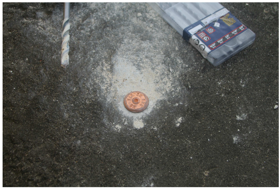
Figure 32: Benchmark pin close-up.