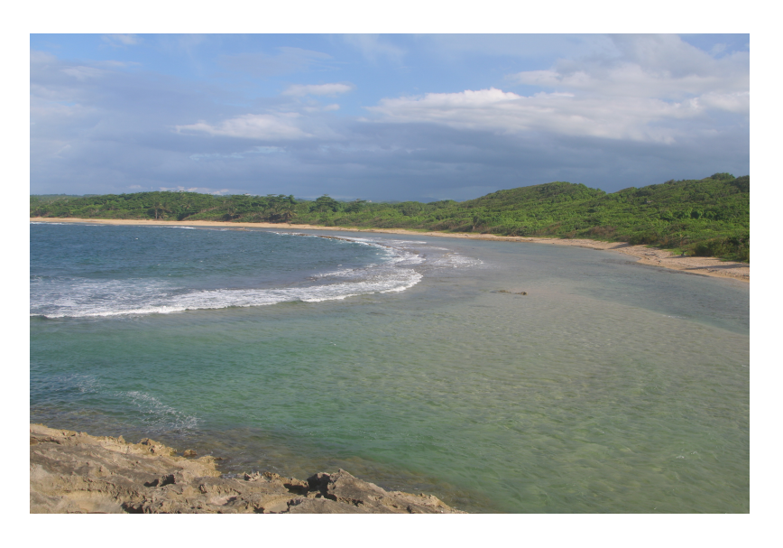
Figure 10: Photo taken from Tómbolo toward the Southeast. Wave breaking show the location of the the beach rock.