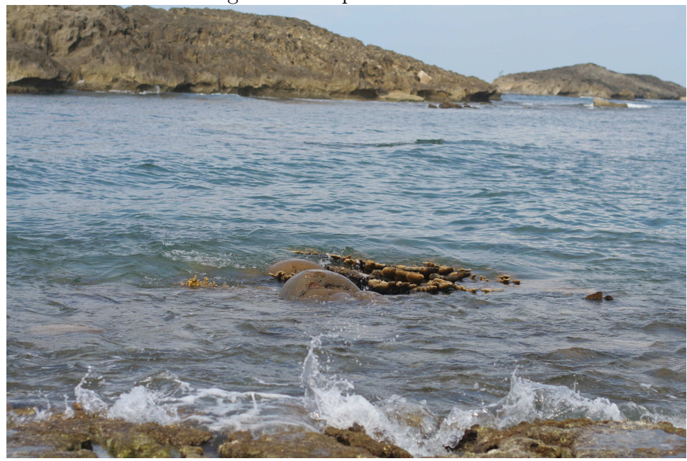
Figure 23: Partially exposed corals (Acropora palmata and Diploria labyrinthiformis). Close-up of this photo shows probability of corals being alive. Closer observations is required.