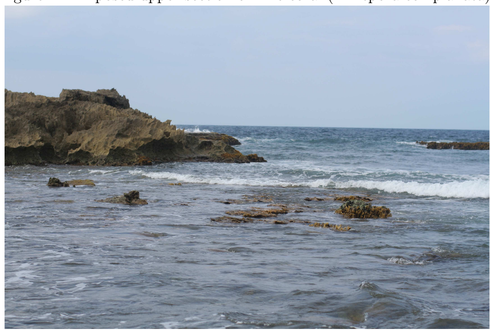
Figure 25: Exposed corals at low tide near the eastern terminus of Punta Manatí.