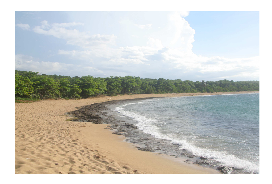
Figure 4: Looking west from Tómbolo. Rock is exposed at both high and low tides. According to locals, beach rock was not exposed in November.