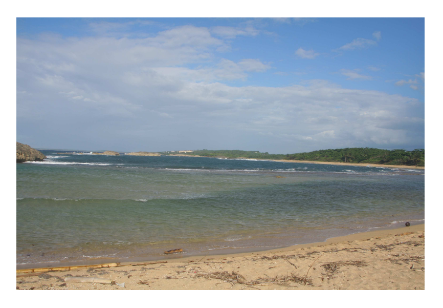
Figure 6: Looking east from Tómbolo. This is the location where the maximum horizontal extent of sea withdrawal has been observed.