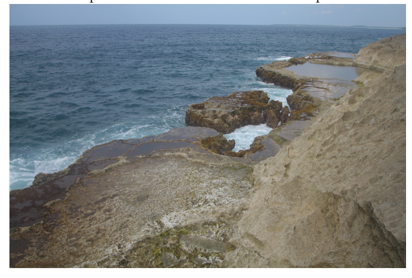
Figure 13: Platform exposed \sim 80\% of the time at low tide.