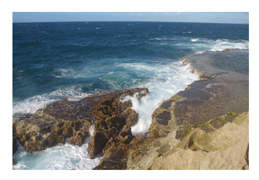
Figure 12: Northern part of Tómbolo where wave-cut platforms are exposed.