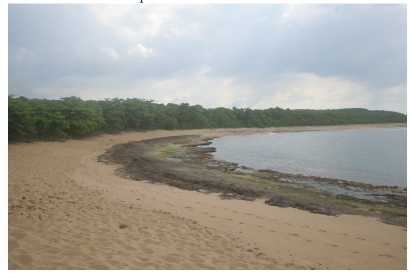
Figure 5: Same location at/near low tide.